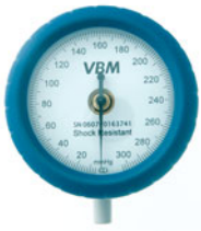
Manometer 300 mmHg shock resistant REF 34-17-300