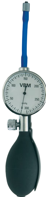
Manometer 300 mmHg with hand inflator, release valve and male Luer Lock REF 51-09-666