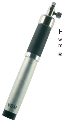
Handpump with release valve and male Luer Lock REF 51-30-000