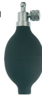
Hand Inflator with release valve REF 51-10-666