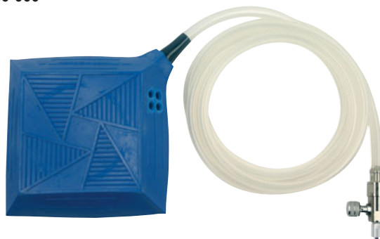
Foot Pump with 2 m (79") silicone hose, release valve and male Luer Lock REF 51-20-000