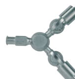
Three-way stop cock with two male and one female Luer Lock REF 51-02-000