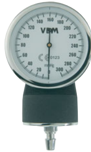
Manometer 300 mmHg REF 20-16-300