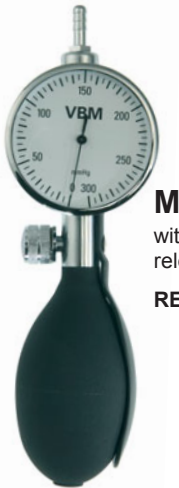
Manometer 300 mmHg with hand inflator and release valve REF 20-18-300