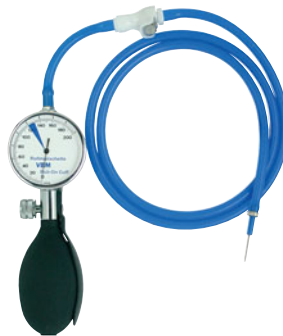
Manometer with 1 m (40") connecting tube REF 21-95-300